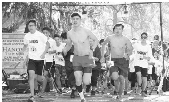
Participants stepping off at the 2018 Annual Sprint 2 Spring 5k.