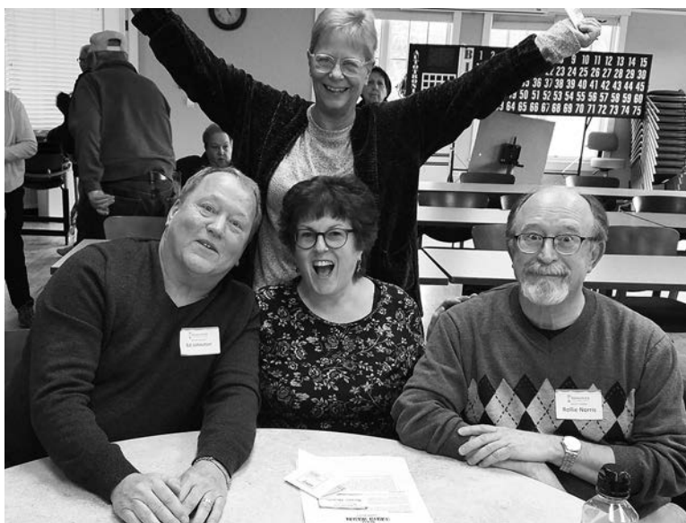
IL State Fair Brain Games competitors from Hanover Township took 3rd Place!

The department was tasked with the goal to reduce the number of participants on wait lists for day trip outings. The Program division addressed this issue by increasing the use of motor coaches, adding second dates of programs, and having patrons drive themselves for local lunch outings. These practices have reduced the number of patrons on the waitlist by 60% from last year. Popular outings were tours of Chinatown, Hamilton the Musical, a haunted bus tour, the Holocaust museum, Tommy Guns Garage, evening dining events, musicals at the Paramount and Drury Lane Theaters, and many museums. Over 35 people went on a three day trip to Shipshewana, Indiana for a tour of the history, culture, and food of the Amish and surrounding areas. The Senior Services competed at the Illinois State Fair in Brain Games competition on Senior Day. The “Sparkles-n-Gears” team tied for third place.