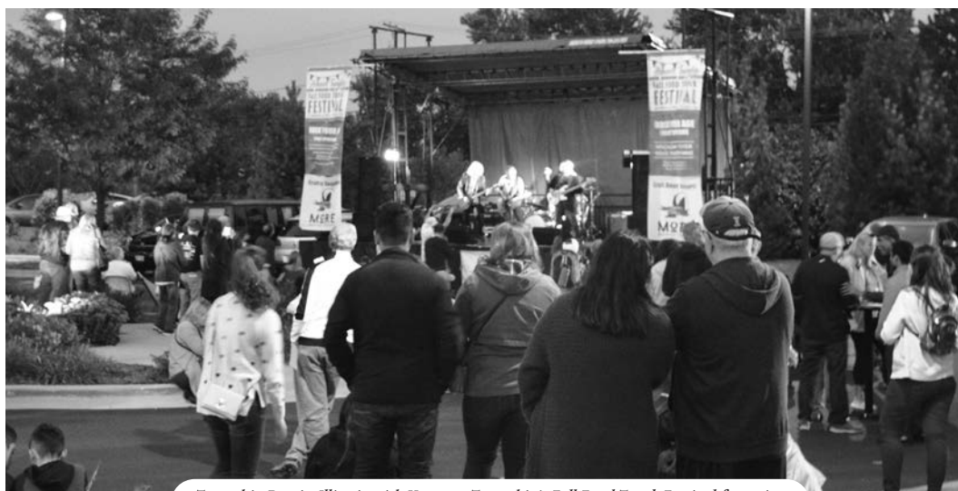
Township Day in Illinois with Hanover Township's Fall Food Truck Festival featuring a Rolling Stones tribute band. Watch for the event in 2019!