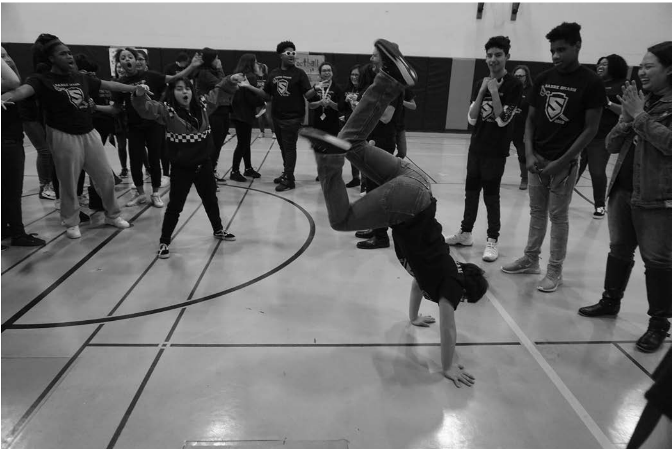
Sabre Smash impromptu Dance-off at Open Gym in 2018