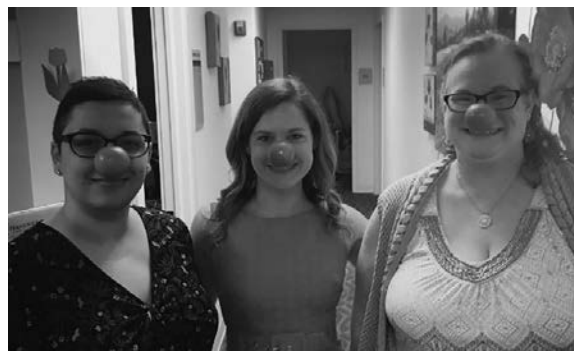
Staff participating in Red Nose Day to raise awareness of child poverty.

Community Health places a high priority on providing education and health promotion for the community. In FY19, it provided hand hygiene education, puberty and CPR certification for over 600 students at U-46 schools. Township nurses also certified staff in CPR and provided Blood Borne Pathogen trainings for the Township Emergency Services volunteers. The annual health expo and community 5k continues to be successful and well attended, promoting healthy and active lifestyles and offering participants valuable screenings and resources. Additionally, the Sprint 2 Spring 5k raises funds for the Township Foundation to assist residents who are experiencing financial hardship. In FY19 over $4,000 in assistance was provided for residents to access dental and medical services.