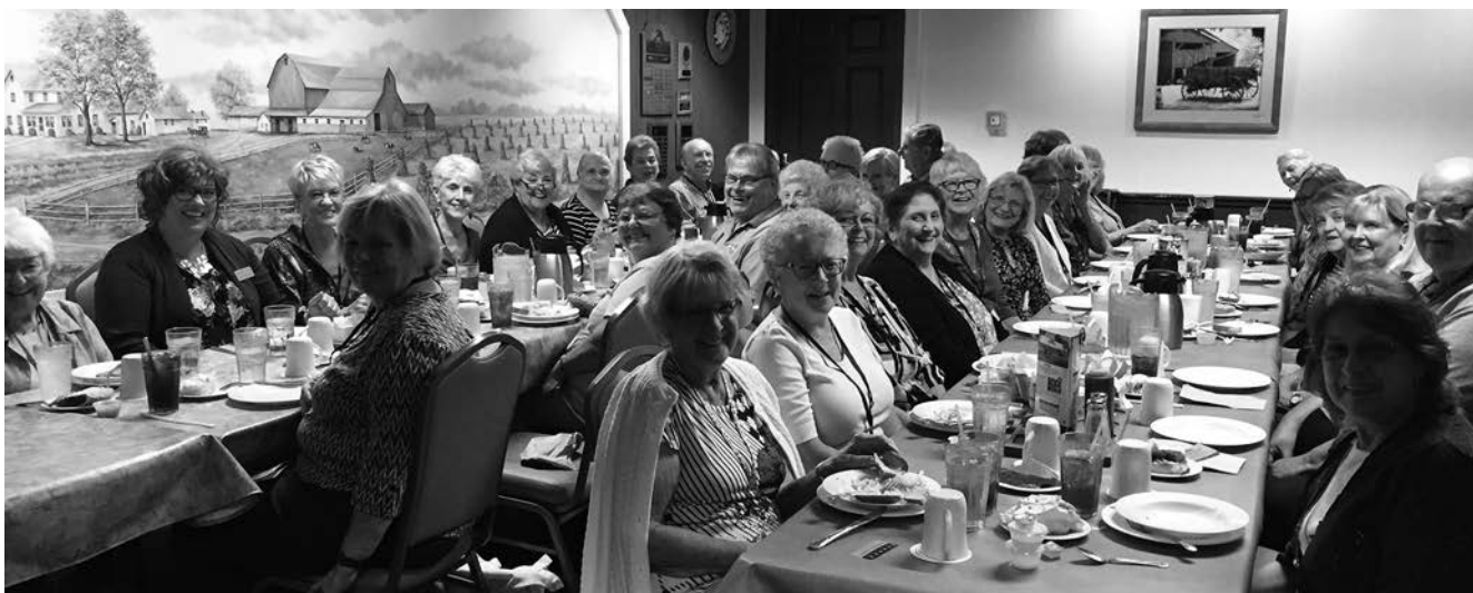
Shipshewana trip a success! Fun for all.