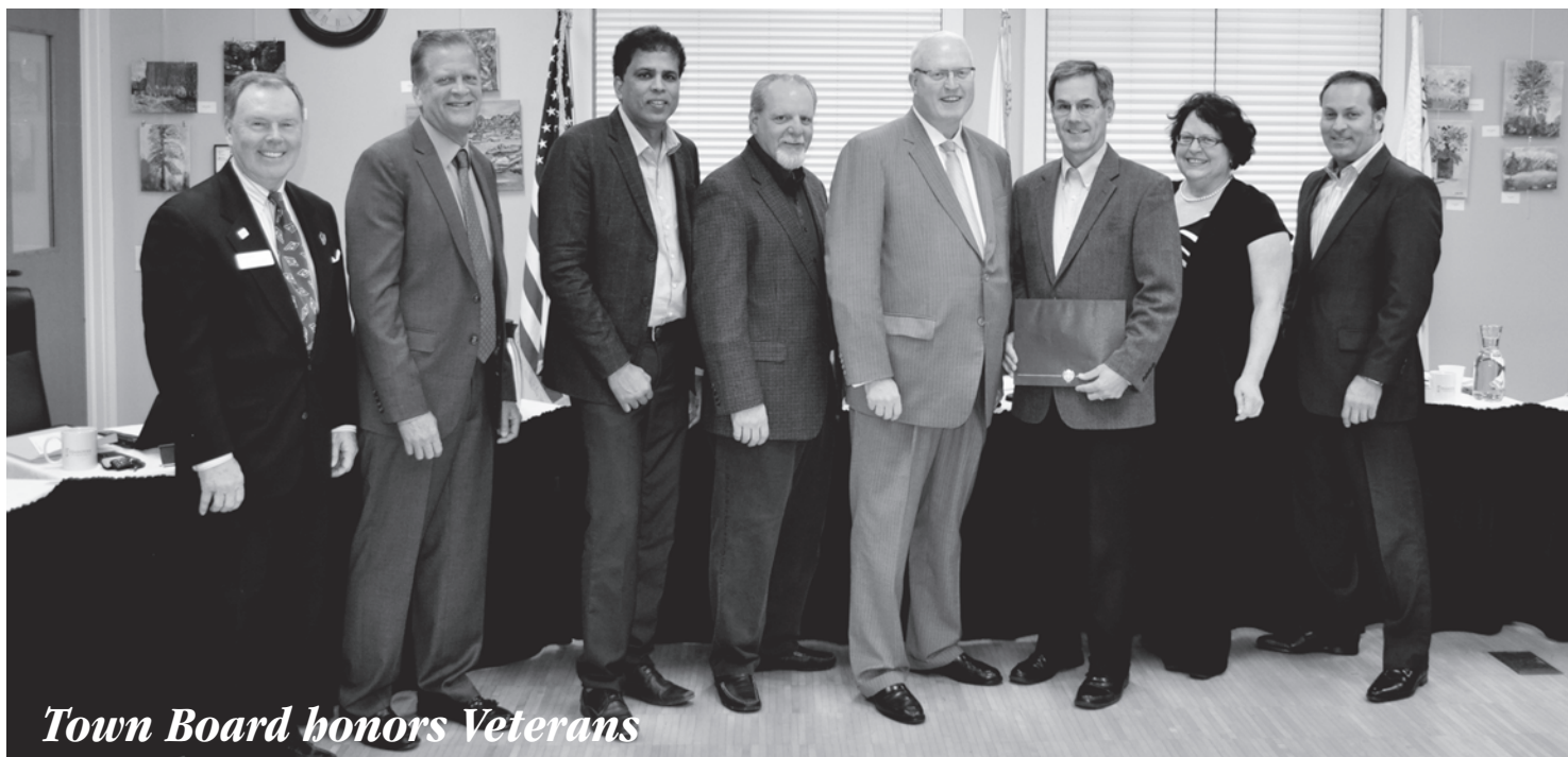
Town Board honors Veterans

Facilities & Maintenance oversaw many tasks and large scale capital improvement projects throughout the Township's three reserves and five facilities. The parking lot at the William Tiknis Campus finally received a much needed resurfacing that also included the creation of 26 new parking spaces to meet the