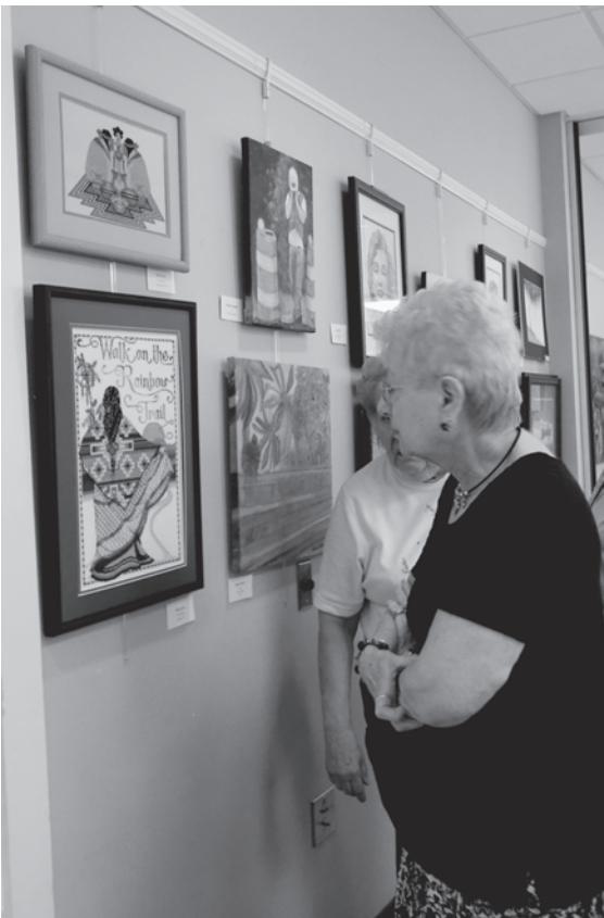
Where great service happens!

Enriching Lives, Fostering Friendships, Promoting Independence