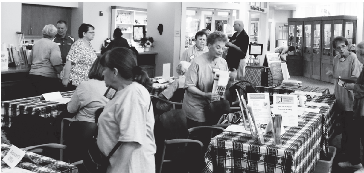
Township Day: Community outreach volunteer group informs attendees on the various ways the Township serves residents.