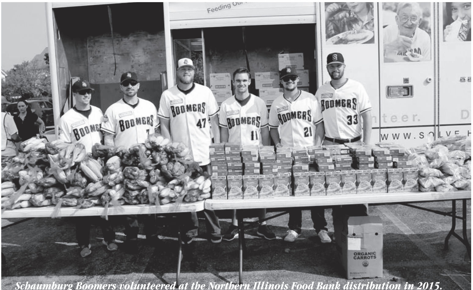
Schaumburg Boomers volunteered at the Northern Illinois Food Bank distribution in 2015.

The food pantry continues to serve residents with more than 9,200 families utilizing the food pantry in FY16. The food pantry operates six days per week with the help of auxiliary volunteer staff. On Saturdays the pantry operates with the help of organizations including St. John the Evangelist Catholic Church in Streamwood, Immanuel United Church of Christ in Streamwood, Kiwanis Club of Streamwood, and Streamwood Woman's Club. It is because of our relationship with the Northern Illinois Food Bank and the Direct Connect Program we are able meet the demand of our community.