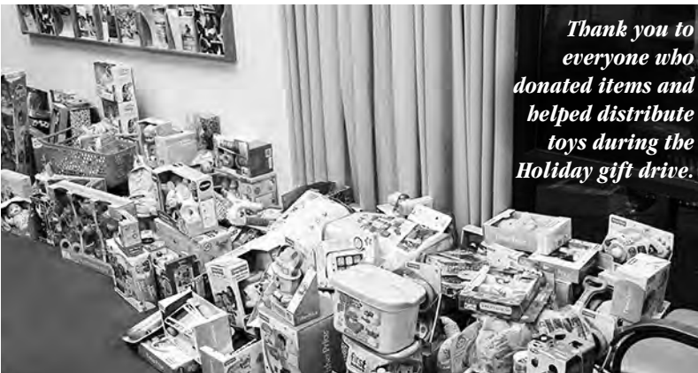
Thank you to everyone who donated items and helped distribute toys during the Holiday gift drive.