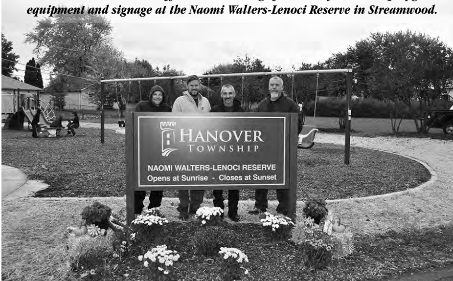
Facilities & Maintenance staff at the unveiling of the newly installed playground equipment and signage at the Naomi Walters-Lenoci Reserve in Streamwood.