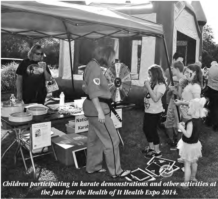
Children participating in karate demonstrations and other activities at the Just For the Health of It Health Expo 2014.

residents after continuing to hear from residents the great need for affordable dental services and the gap that exists within the community. The Dental Access Network is a program designed to help connect low income, uninsured Township residents with dental providers in the community to access and receive needed dental services at an affordable cost. We have partnered with several dentists in our community who have graciously volunteered to be a part of this program and provide these valuable dental services to residents at significantly reduced rates.