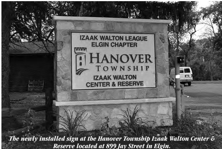
The newly installed sign at the Hanover Township Izaak Walton Center & Reserve located at 899 Jay Street in Elgin.

FY15 included the office's first full year at the Izaak Walton Center & Reserve (IWCR) at 899 Jay Street in Elgin. This past year we expanded programs in the Elgin area and introduced new services and events. Veterans services began at the IWCR two days a week. The Youth and Family Services department had strong participation in their summer Open Gym program at the IWCR. Last May, the Township's inaugural 5k run/walk stepped off from the property and into the surrounding neighborhood to raise money for a new dental program for low income residents. Last August the Township partnered with two neighbors in planning and hosting our first city-wide National Night Out event in conjunction with the City of Elgin and the Elgin Police Department. The turnout was great and we look forward to making this an annual event.