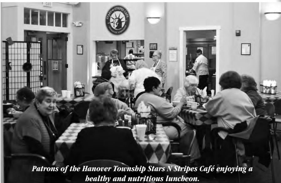
Patrons of the Hanover Township Stars N Stripes Café enjoying a healthy and nutritious luncheon.

The Stars-N-Stripes Café grew in service and space. The congregate meal site serves an average of 40 participants per day, dining on fresh and nutritious meals. The Senior Nutrition Advisory Group was created to facilitate feedback and improvement by seniors who dine at the café. The