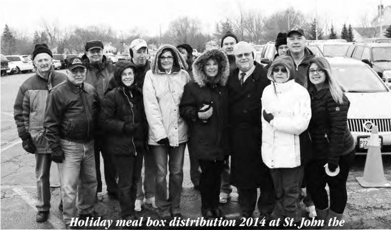
Holiday meal box distribution 2014 at St. John the Evangelist Church of Streamwood