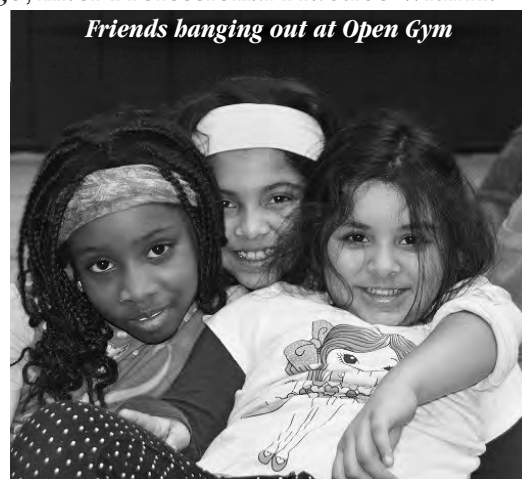
Friends hanging out at Open Gym

Our After School Open Gym Program continues to provide social, recreational, and educational activities based on positive youth development for youth at nine sites per week. We have implemented Restorative Practices into two of our sites by adding Restorative Circles. Restorative Circles offers participants the opportunity to have a voice and be heard. Restorative Circles encourages and supports a positive atmosphere where differences