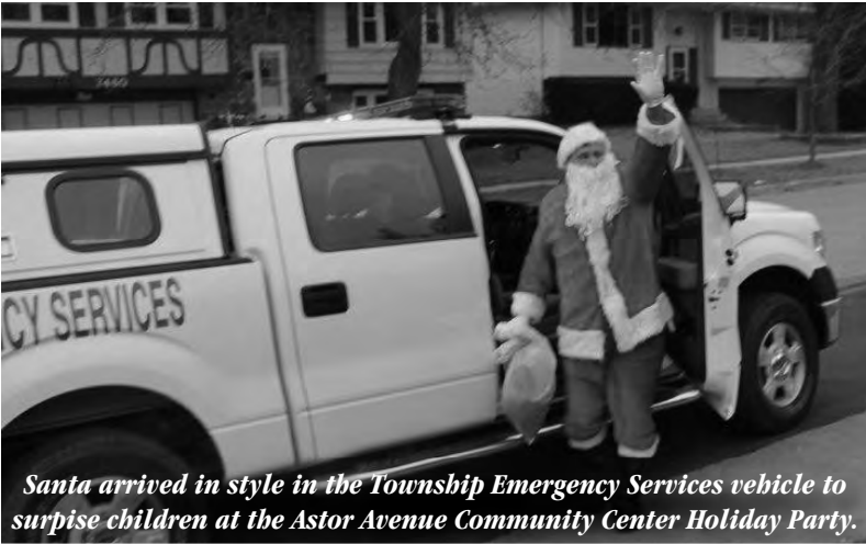
Santa arrived in style in the Township Emergency Services vehicle to surprise children at the Astor Avenue Community Center Holiday Party.