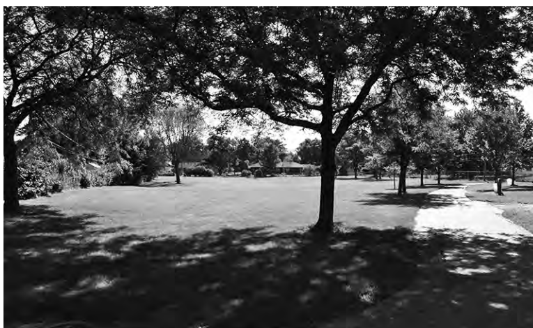
Hanover Township Lacy Park