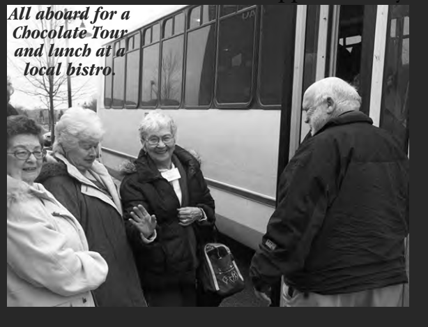
All aboard for a Chocolate Tour and lunch at a local bistro.

Creating efficiency in the Dial-A-Bus transportation service has been a long term goal for the Township. The Hanover Township Board approved the purchase of dispatch software and a bid process was completed. Based on the recommendations from the Township's software consultant, the Hanover Township Board determined that the lowest responsible and responsive bidder meeting specifications based on the base bid and alternates approved by the Board was Ecolane. The advantage of the system is that when the dispatcher inputs a client, the system will choose the most efficient route, maximizing the potential of our services. With the actual cost of a ride at approximately $20 each way and the requested donation at $1 each way, the