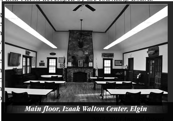
Main floor, Izaak Walton Center, Elgin