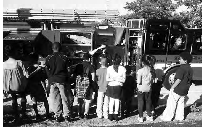
A Hanover Park firefighter educated children during Fire Prevention Week at the Astor Avenue Community Center