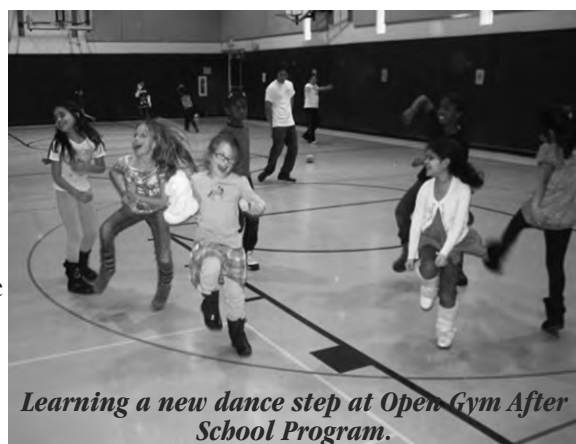
Learning a new dance step at Open Gym After School Program.

Our After School Open Gym Program continues to provide social, recreational, and educational activities based on positive youth development for youth at nine sites per week - efforts are taking place to expand weekly offerings to include day time programming as well as integrating Restorative Practices.