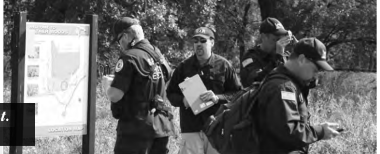
HTES members received Ground Search & Rescue Training.