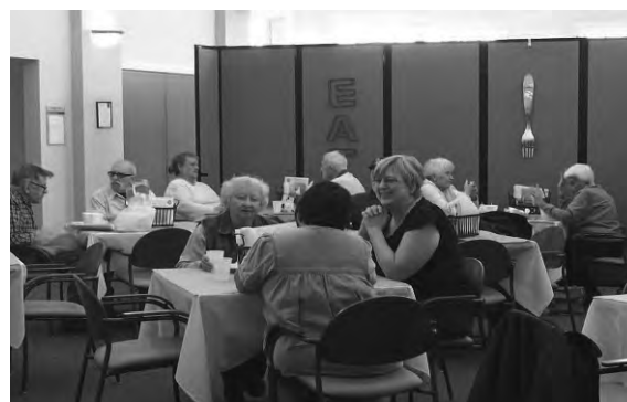
Residents lunching at the Stars 'N Stripes

This year has been a remarkable one for Senior Services. Noteworthy, is the expansion of our services to include the Stars 'N Stripes Café, the implementation of dispatch software, and the Senior Lip Dub YouTube video. Hanover Township completed a nutrition service analysis that included visits to other senior centers and a Mathers Café. The result of our research indicated that seniors wanted a choice of entrée and fresh food made daily at a reasonable price. AgeOptions, our Area Agency on Aging, funded the program with matching funds from the Township. The total Township match is estimated at 79.3% of total cost, with 20.7% of cost being covered by AgeOptions. Of the Township match, 55.6% originates from property tax revenues, 13.2% from meal donations and 10.5% from in-kind donation of volunteer workers. The day the café opened was a minus 13 degree day in January and 12 seniors enjoyed lunch that day. We continue to exceed the service levels of the grant averaging 30 meals per day and are ecstatic to offer creatively cooked healthy meals. Recently Senior Services was awarded $16,433 from AgeOptions to expand the infrastructure of the kitchen and create an areoponic garden to grow our own lettuce year round. The café is open for lunch, Monday through Friday, from 11 a.m. to 1 p.m.