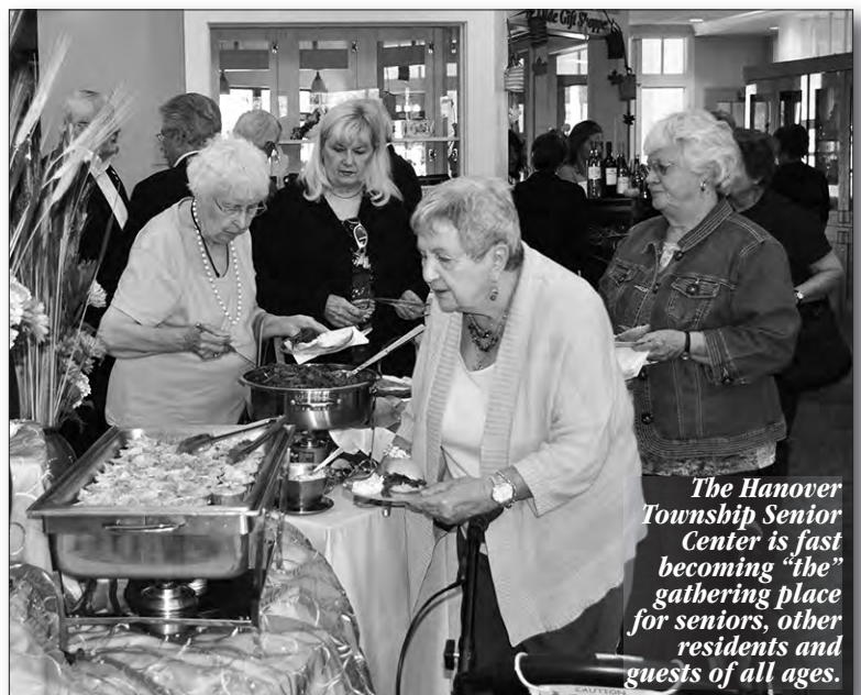
The Hanover Township Senior Center is fast becoming "the" gathering place for seniors, other residents and guests of all ages.