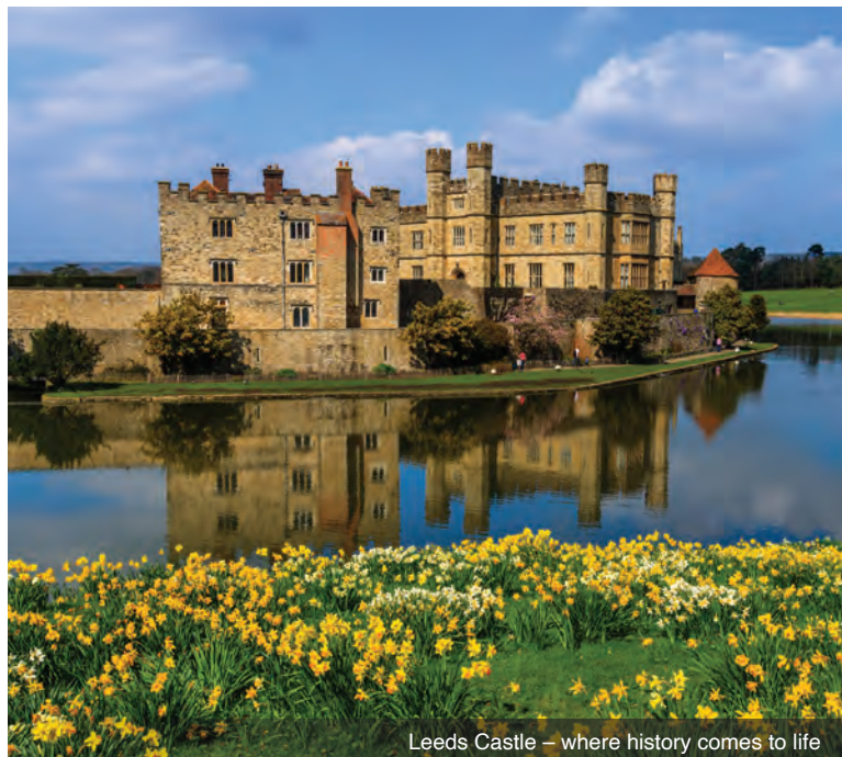
Leeds Castle – where history comes to life

DAY 1 Depart the USA: Depart the USA on your overnight flight to London, England.