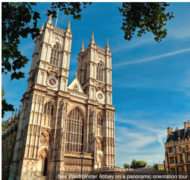
See Westminster Abbey on a panoramic orientation tour