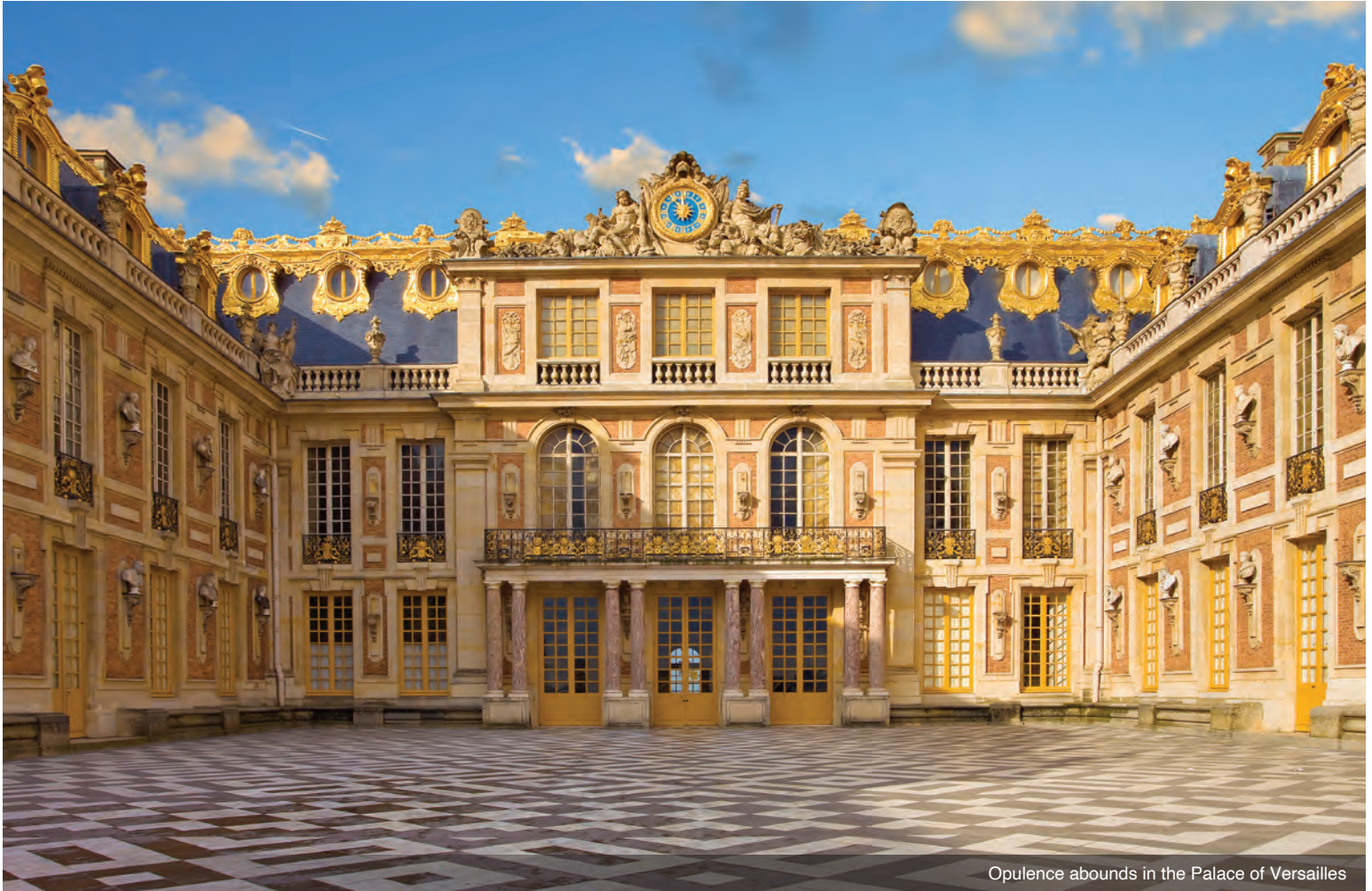
Oplulence abounds in the Palace of Versailles