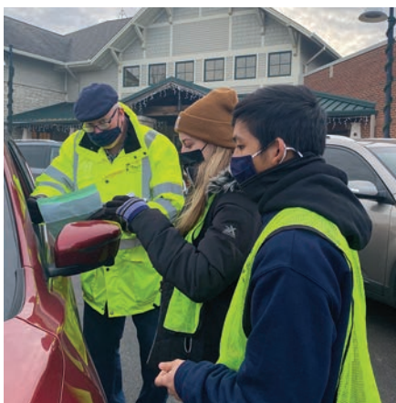
A big “thank you” goes out to the Streamwood High School students who participated in the Hanover Township Christmas gift distribution.