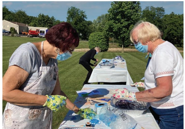
Summer Art Camp 2022 Ice Tie Dyers