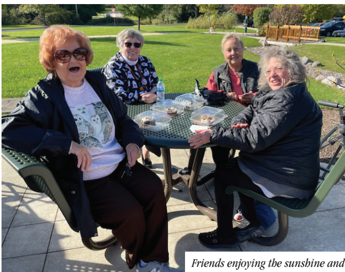
Friends enjoying the sunshine and cake at the Runzel Reserve.