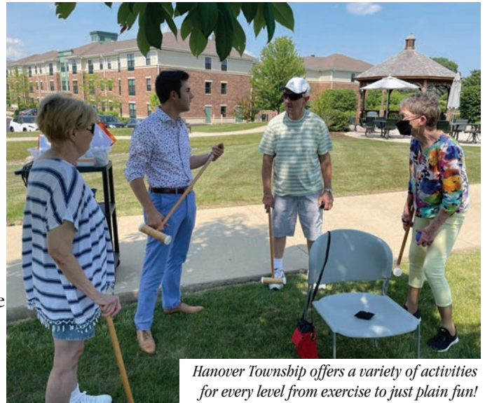
Hanover Township offers a variety of activities for every level from exercise to just plain fun!