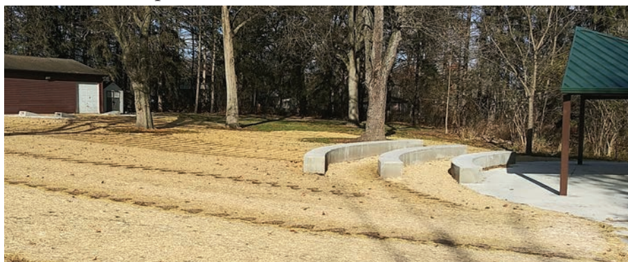
Izaak Walton Reserve Ampitheather - almost ready for FY23!

These two projects highlighted a year which also saw the return of in-person programming, dining and meetings, Township events, and a move toward pre-pandemic levels of participation by both residents and staff.