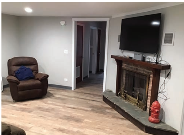
Newly remodeled Hanover Township Emergency Services Station

While the expansion property played a significant role in the department’s activities, Facilities and Road Maintenance also directly assisted in the completion of the long-awaited Izaak Walton Reserve OSLAD grant project. An addition of a quarter mile paved and boardwalk walking trail, challenge course, and orienteering course on the east side of Poplar Creek, an amphitheater, seating, and baggo courts were added on the west side of the property adjacent to the lodge. The major construction was completed in December with only landscaping, native plantings, and restoration to finish the project this spring. This project will enhance Izaak Walton Youth Center’s activities and offer area youth and the community as a whole, an opportunity to better use and access the beautiful, natural areas that make up the Izaak Walton Reserve.