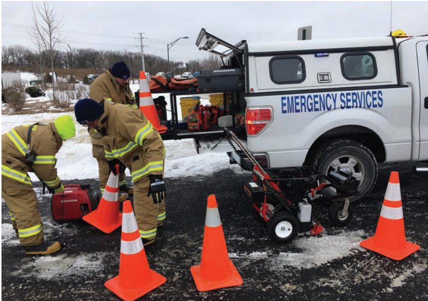
No matter the weather, where there is a need, the Hanover Township Emergency Services unit responds.

In FY22, HTES expanded recruitment efforts to include attending the College of DuPage Career Day and addressing the students in the Elgin Community College Emergency Services programs. HTES continues to have a robust presence on their Facebook page which highlights many of the response and training activities through the year. Once an application is received to join HTES, the applicant will appear before the three-member interview panel, followed by a background check, drug screen, and driver's license check. If an applicant passes all four adjuncts, the applicant meets with the operations Captain to determine which officer will be assigned to lead their training